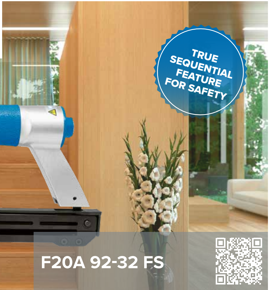
F20A 92-32 FS