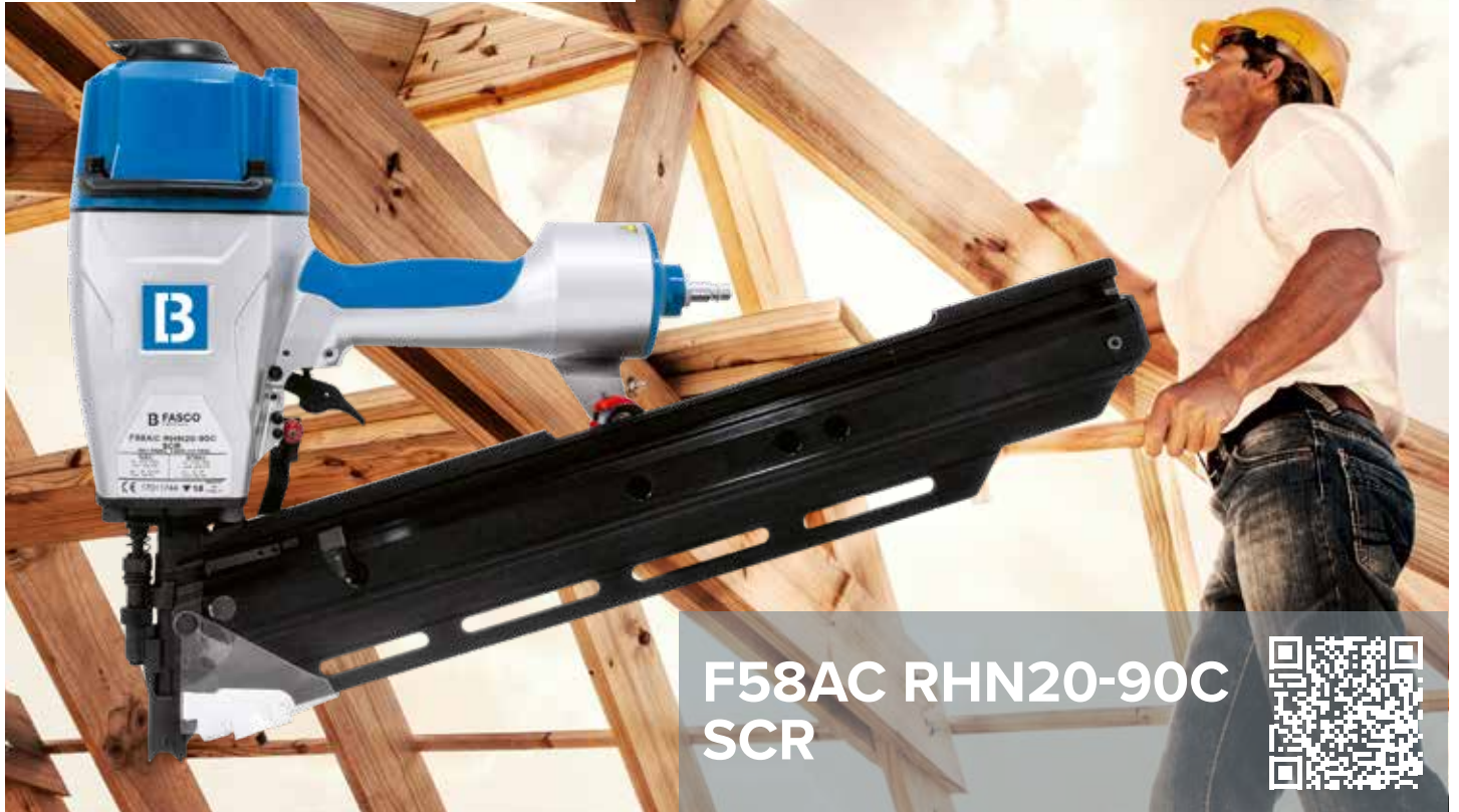
F58AC RHN20-90C SCR