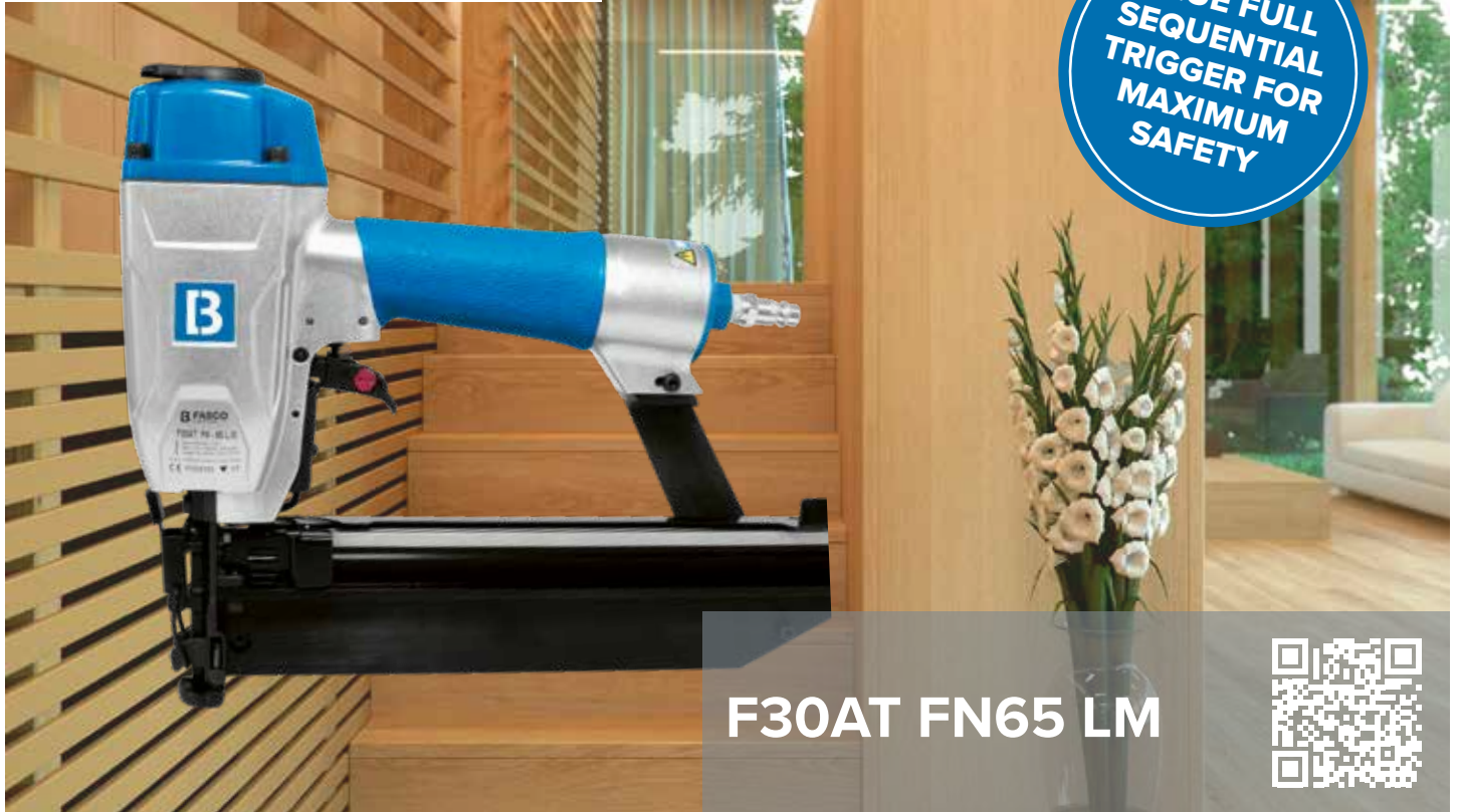
F30AT FN65 LM